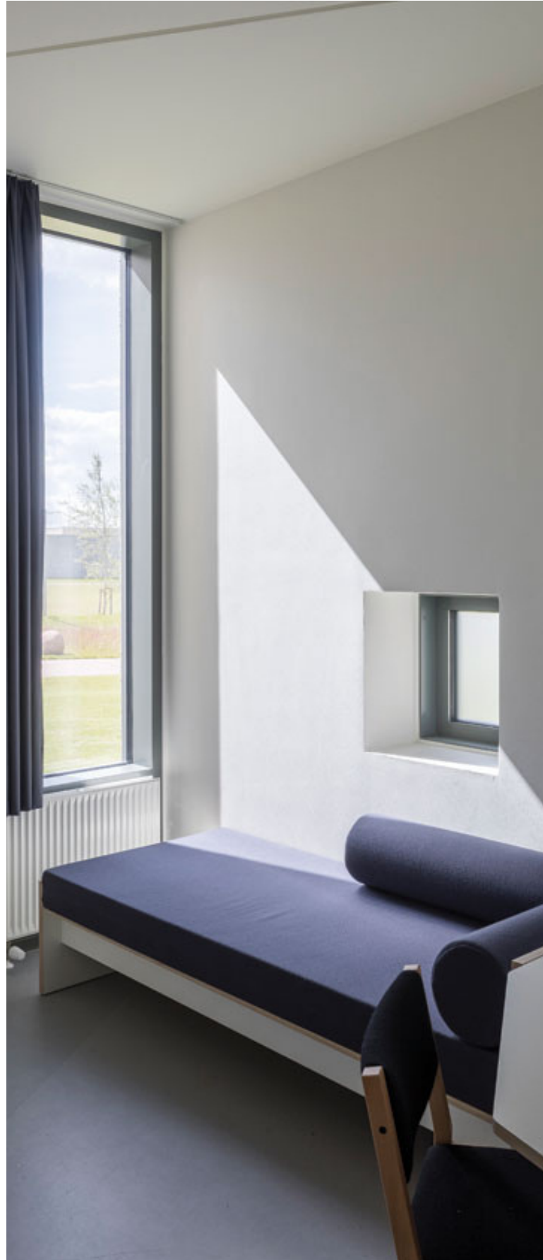
Pictured above: a cell from a Danish maximum security prison

The good news is that—finally—many correctional systems are recognizing that using isolation and other forms of violence, on top of being cruel, is short-sighted and counterproductive. Instead, more systems are turning to alternatives, including pro-social programming and mental health treatment. And many systems are thinking far outside “the box” by turning to violence prevention and restorative justice to get at why disputes happen in the first place. This short report outlines the many tools that Connecticut could use to ensure safety without sacrificing humanity.